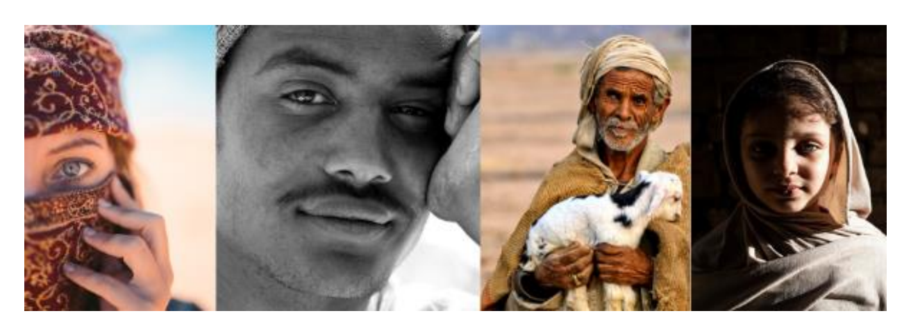
Exotic Nile Cruises