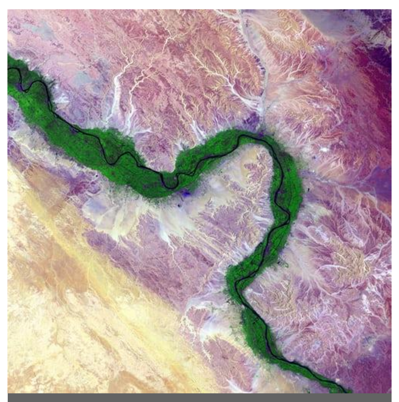
A picture speaks a 1000's words!

How can you not want to explore more of the magic of Egypt?